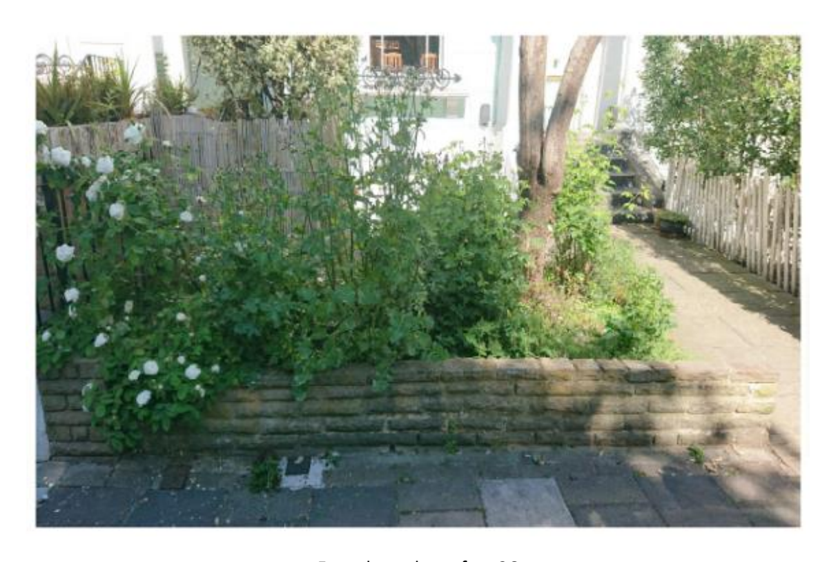
Front boundary of no.26