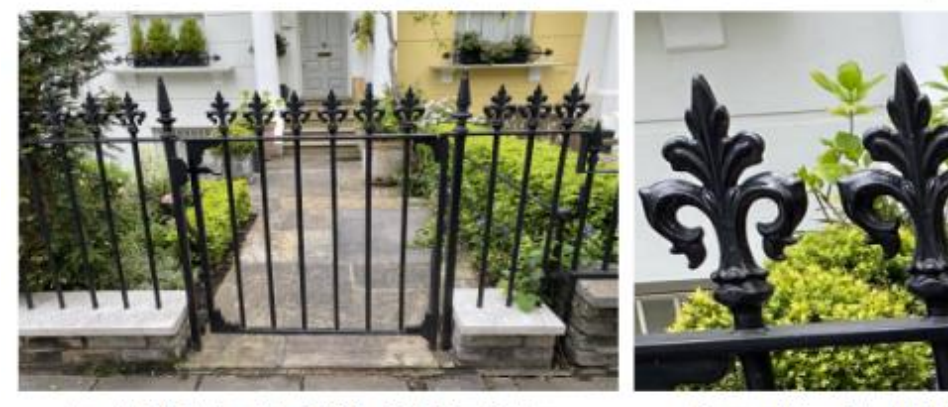
Low Wall & Coping at No. 20 SP with Existing Railings